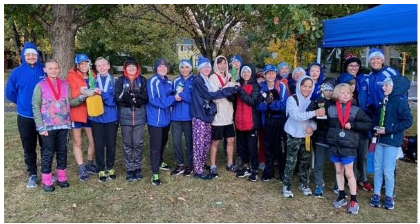
Above: Our undefeated Cross Country Team

Congrats to all fall athletes. We are transitioning to our winter sports of basketball, nordic skiing and indoor track and field. Here is this month's <u>sports update</u>. With questions, please contact <u>Athletic</u> <u>Coordinator Tabisz</u>